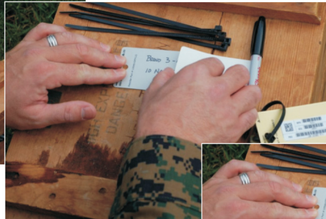
2. Remove Liner