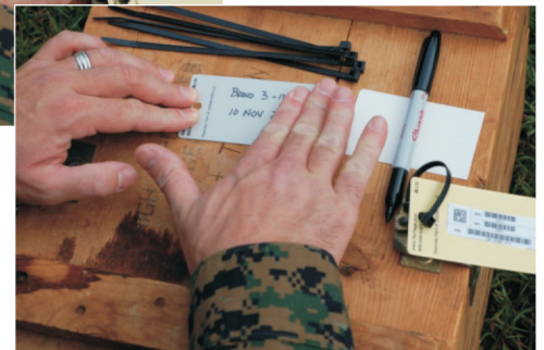
3. Seal Cover

TacTags are designed to be durable, reliable, and practical for use in various applications: