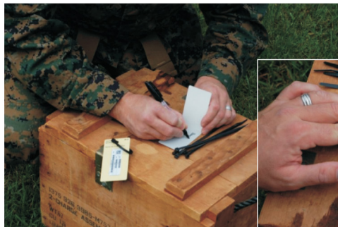
1. Record Information